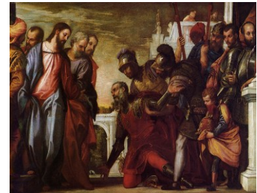
Jesus Heals the Royal Official's Son