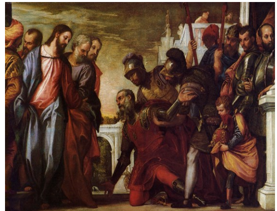
Jesus Heals the Royal Official's Son