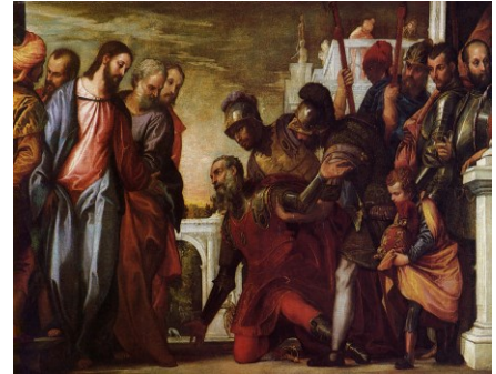
Jesus heals the royal